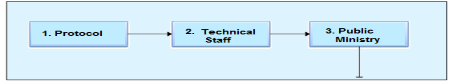
Figure 2: Ideal Diagram

the Court researched, resulting in an ideal diagram indicated in Figure 2 below.