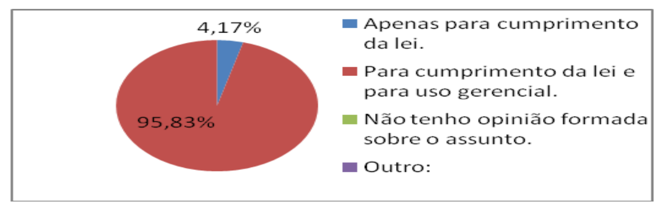
Figure 2: Perspective on SICS deployment

to improve and update their knowledge, considering the minimum degree for investiture in public office. Figure \mathbf{2} contemplates the results obtained in the last issue of this topic, whose purpose was to respondent's identify the perception regarding the state's perspective on the implementation of the Public Sector Cost Information System.