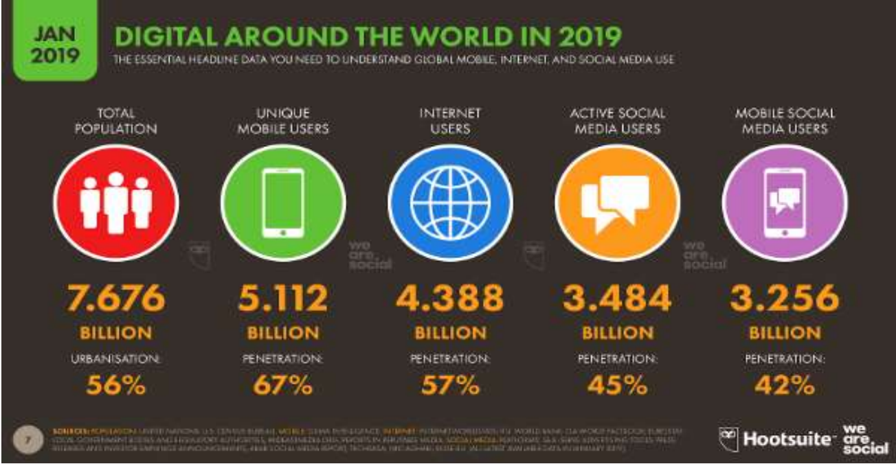
Figure 1: Shows number of users is increasing rapidly Digital Hootsuite.com [10]

According to Fallows [9] many internet users in the United states use the internet for health consultation; in the year 2000 which was still the beginning of the internet craze over 54% of adults used the internet for self diagnosis and 38% of the adults used the internet for information about exercise and fitness, and the previous number have only grown since the study. As seen in Figure (1) according to Hoot suite a social media management service providing website, there is a 57% penetration of internet users worldwide: