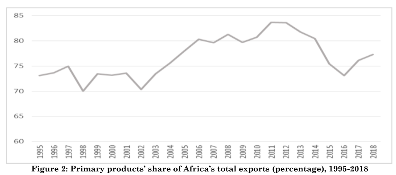
Source: United Nations Conference on Trade and Development Statistics (UNCTAD Statistics)

Source: Source: United Nations Conference on Trade and Development Statistics (UNCTAD Statistics)